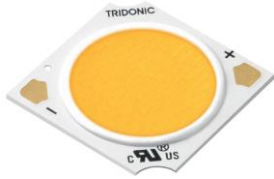
TRIDONIC LED Module