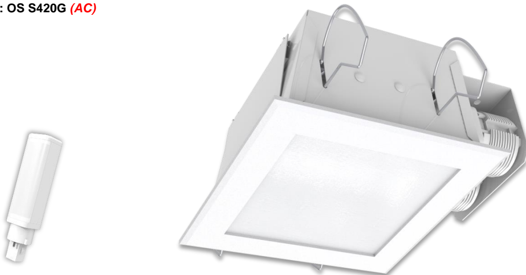
PHILIPS CorePro LED PLC (G24d)